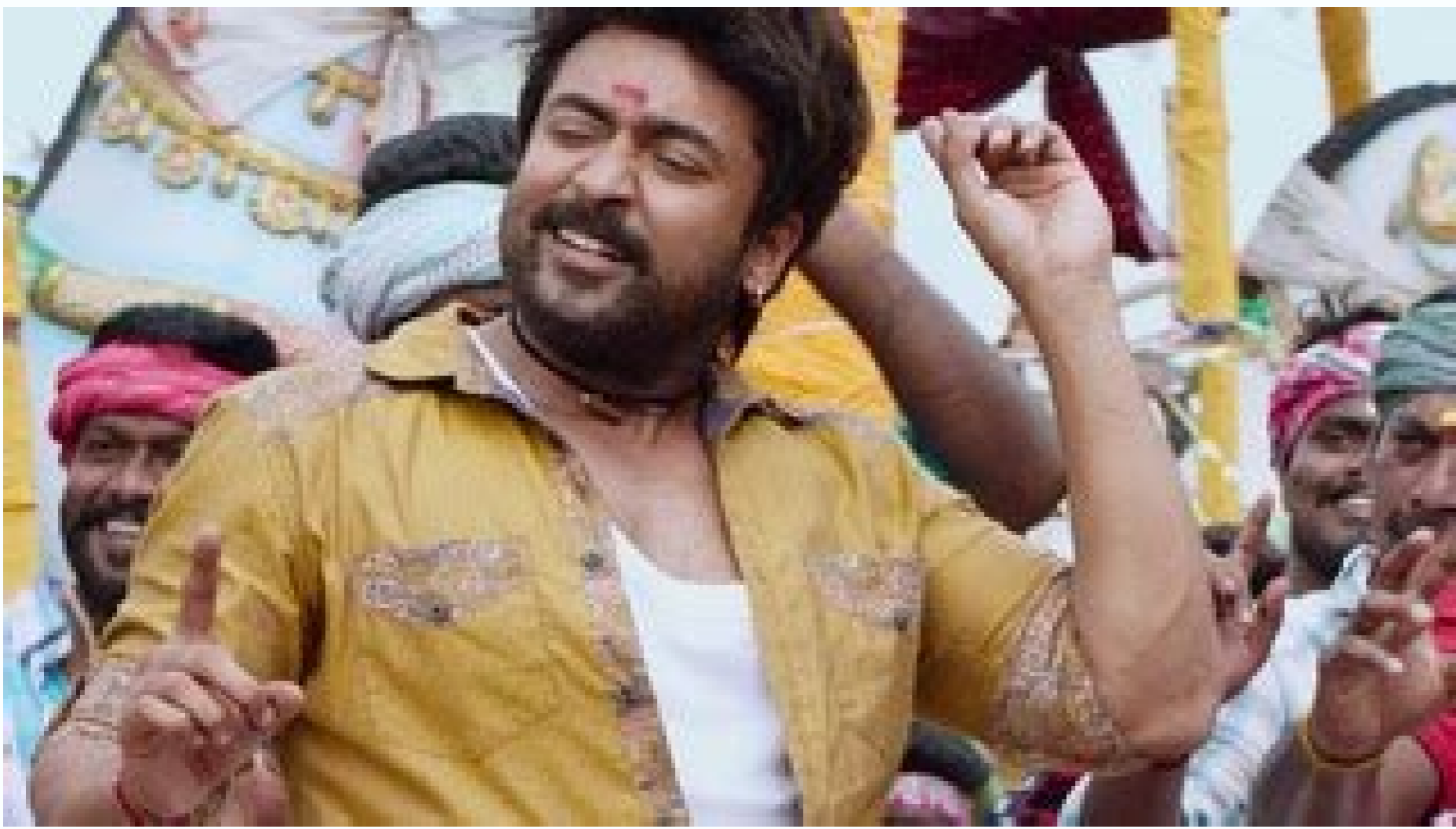
Bandobast movie video songs download.